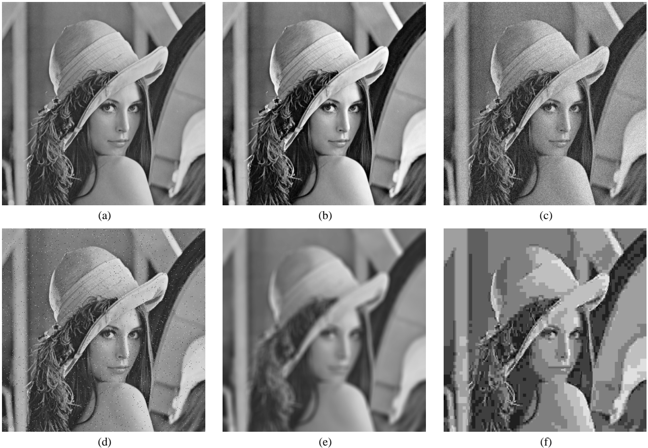
Fig. 3. Evaluation of “Lena” images distorted by different means. (a) Original “Lena” image, 512 \times 512 , 8bits/pixel; (b) Contrast stretched image, MSE = 225 , Q = 0.9372 ; (c) Gaussian noise contaminated image, MSE = 225 , Q = 0.3891 ; (d) Impulsive noise contaminated image, MSE = 225 , Q = 0.6494 ; (e) Blurred image, MSE = 225 , Q = 0.3461 ; (f) JPEG compressed image, MSE = 215 , Q = 0.2876 .