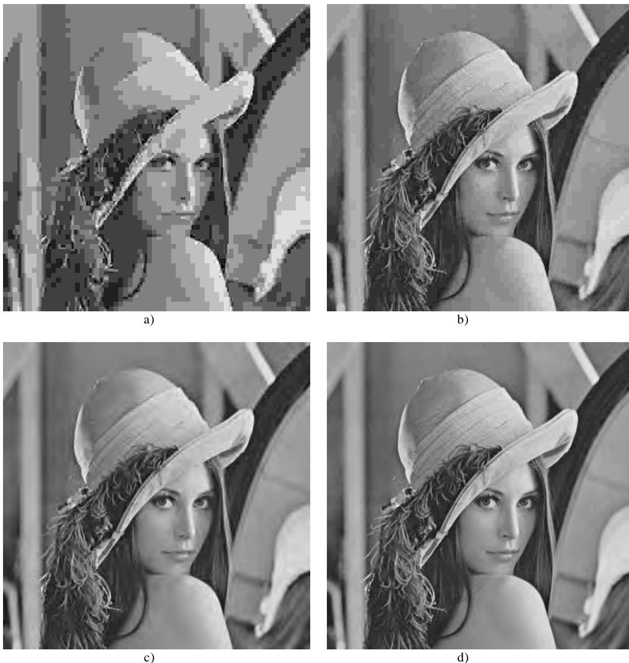
Fig. 1. Lena image compressed using JPEG a) and b), and using wavelets (LTW c) and d) (left column at very low bit rates (0.125 bpp approx.) and right column at low bit rates (0.25 bpp))

in figure 1, that clearly states what objective measures have revealed.