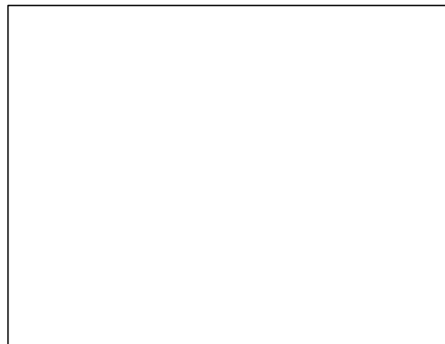
Fig. 4: Relation between quantization parameters and PSNR